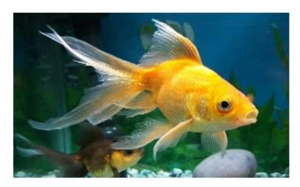
I have a pet goldfish.