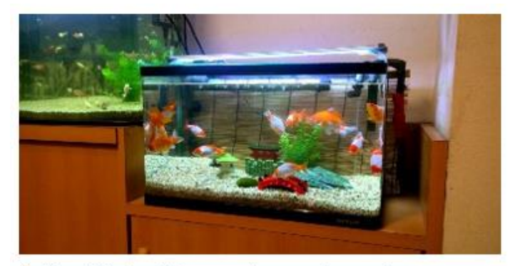
My fish lives in a tank.