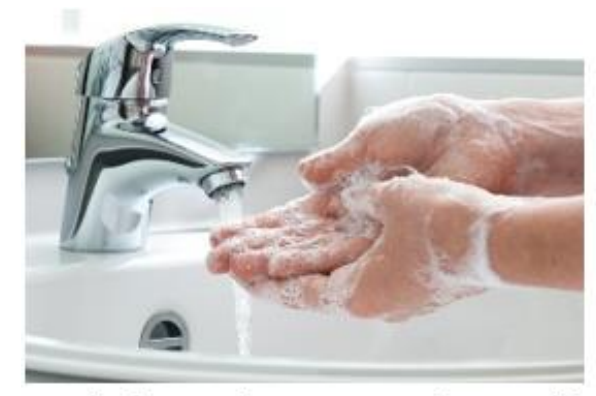
Rub hands to wash well.